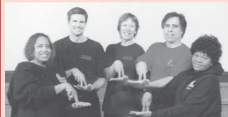
S.T.A.N.D. Board of Directors

S.T.A.N.D. PO Box 22424, Seattle, WA 98122 (206)229-0536 www.standproductions.org.